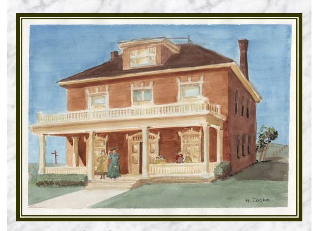
So Glad You are Here!

Note cards are reproductions of original watercolors depicting the Bishop Home in Casper, Wyoming. Proceeds support the Cadoma Foundation, a Wyoming non-profit corporation committed to the preservation of Wyoming's historic property.