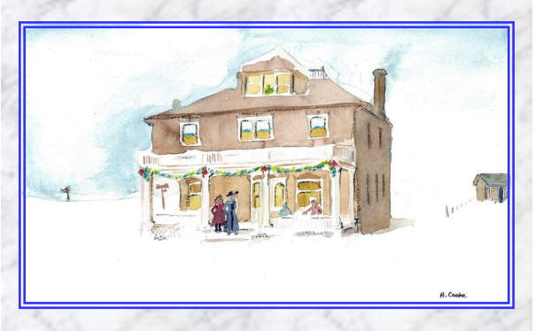
Ah! Fresh Snow for the Holidays!